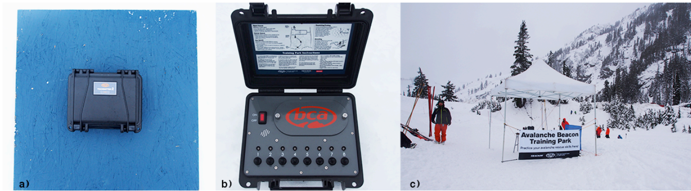
Figure 1. a) Practice beacon in waterproof case on plywood. b) Beacon park control box. c) Beacon park area.