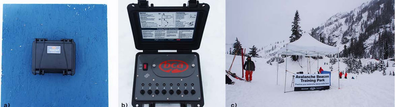
Figure 1. a) Practice beacon in waterproof case on plywood. b) Beacon park control box. c) Beacon park area.

We had 22 participants (5 female, 17 male). 10 were part of the ski area volunteer patrol and 12 from the general public.