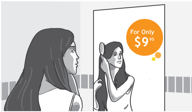
Figure 1. Novo Ad screenshot (sketch by David Ledo).

woman becomes the captive audience, as her primary task is to use the sink and mirror for grooming. The video ad, which starts on her approach, is the unsolicited system action. Other captive locations listed by Novo Ad include dressing rooms and elevators.