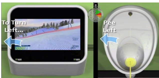
Figure 2. Captive Media screenshot (YouTube ID: XLQoh8YCqo4#t=44), © Captive Media, with permission.

As another example, BBDO Düsseldorf and Sky GO developed a device that can transmit audio advertisements to commuters resting their head against the train window. Commuters suddenly hear an advertisement that is inaudible to other passengers and sounds like a voice in their head. The transmitter works by sending high-frequency vibrations through