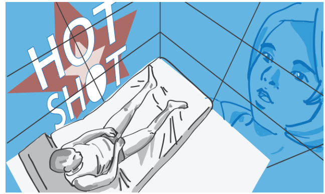
Figure 3. Scene from Black Mirror (sketch by David Ledo).

the window, which are then picked up in the commuter’s inner ear using bone conduction.