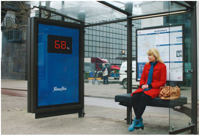
Figure 7. The Fitness First health club display.

stop's wall. Its purpose is purportedly to motivate people to join the health club by intentionally publicizing their weights and offering them a price reduction fee of their weight in Euro's in return.