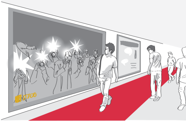
Figure 4. The Nikon D700 Billboard (sketch by David Ledo).

An example of an existing simple but compelling public display in this genre is the Cheil Worldwide Nikon D700 Guerilla-Style Billboard (Figure 4). Located in a busy subway station in Korea, it displays life-size images of paparazzi that appear to be competing for the passerby's attention. When the passerby is detected in front of the billboard, lights flash (as in Figure 4) to simulate flashing cameras. The red carpet leads to a store that sells the type of cameras being used.