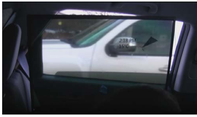
Figure 3: The ever-present widgets present the time, temperature and the direction

When the car passed by a certain building, the iWindow showed a cartoon avatar along with texts saying "Chris is Here!" superimposed on the building to show the user's friend's hypothetical location as an active notification (Figure 4). After the building was out of the iWindow (so, out of the user's view) the notification was also turned off.