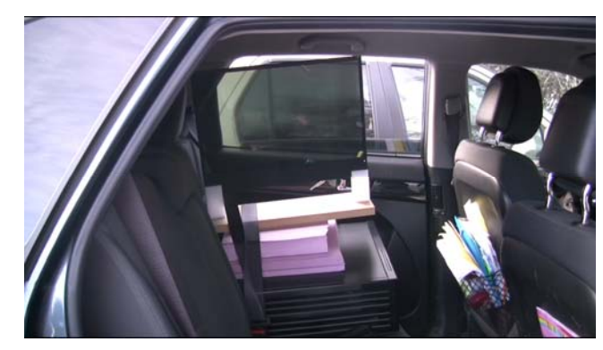
Figure 1. The setup of the Car iWindow.

Believing that an interactive vehicle window should be informative but not distracting, we propose a simple 3-phase interaction paradigm to realize rich and undistractive interaction on side windows. We then present our prototype, the Car iWindow (Figure 1), whose design follows our side window interaction paradigm and is implemented using a transparent LCD display and installed in a car. Using the iWindow prototype we ran a Wizard of Oz (Woz) operated design critique reflecting on the user experience while interacting with our prototype during drive around our university campus. We hope that our work-in-progress effort can highlight some of the challenges and promises of this interaction design problem, and serve future explorations of interactive side windows.