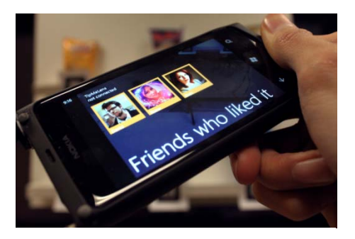
Figure 4: Social Network data can be used as recommendations.