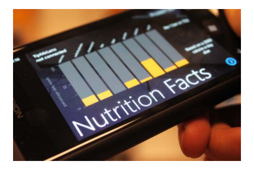
Figure 2: Nutrition facts will show up as a detail on demand when a person taps over the highlight –revealing information as to why a food item is recommended.