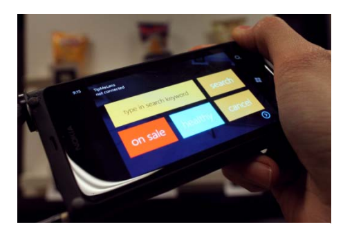
Figure 3: shows the menu from which users can select to browse other predefined searches or search with their own keywords or queries.

Figure 2: Nutrition facts will show up as a detail on demand when a person taps over the highlight –revealing information as to why a food item is recommended.