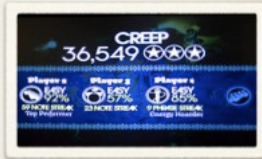
Images from the Xbox 360 Guitar Hero manual & dreamyouralive's Flickr photostream