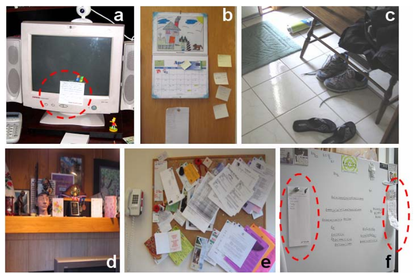
Figure 2: Examples of Information Types

sensitive. The goal of messages in this category is to convey information at the right time, whether this time is related to the urgency of the message (e.g., a reminder to call the shop right away, since it closes early), or to its relevancy (e.g., remembering to return a DVD on your way to work, or remembering what errands you need to run on the way home). Another example is a mother who wanted to remind her son that he is to put dinner in the oven when he arrives home from school. She placed this note on the son's computer monitor because there is some urgency to it illustrated in (Figure 2a).