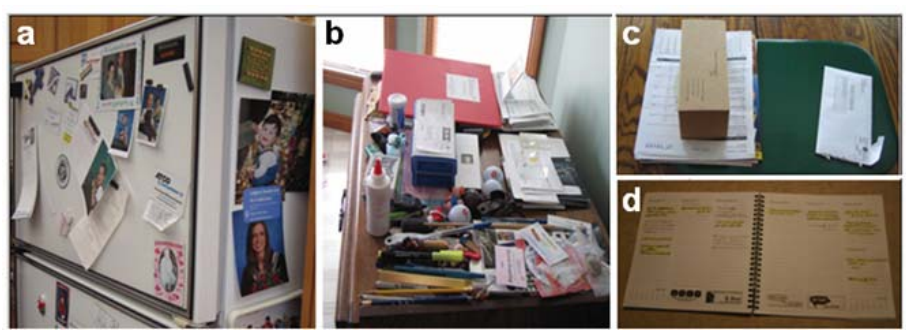
Figure 5: Spatial Ownership

ownership to information. Not all information within the home is relevant to all members, so households use locations to define who information belongs to. This allows people to not only manage complexity, but to answer the questions whose information is this and what needs to be done with it.