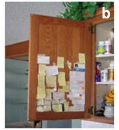
Figure 4: Information dynamics