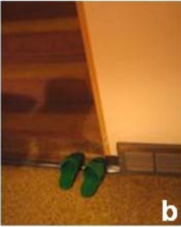
Figure 6. Slippers show presence and location .