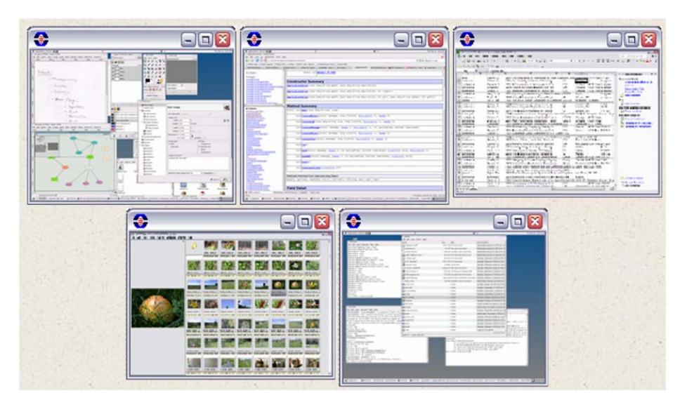
Figure 1: Multi-VNC, showing five collaborator's screens scaled to fit onto a secondary screen. The user's main screen is not shown.

Even this simple setup showed that some of the community-based principles are valuable. Multi-VNC allows group members to see each others' work in general (what applications are running, but not data in those applications), allows people to send text messages to one another, allows pointing from the overview to the original screen, and allows people to zoom in to a full share with the other person's system. There were two clear disadvantages, however. First, all the connections, scaling, and zooming had to be done manually, with commands issued through the VNC control dialogs. This was difficult and time-consuming; it is clear that this is not a viable alternative for a real work community without a wrapper application that simplifies connections and provides shortcuts for common functions like zooming in to another person's workspace. Second, Multi-VNC provides no representation of people. This makes it difficult to remember which workspace belonged to whom, and difficult to determine who was active or away from their computer. Furthermore, it was impossible to see who was looking at your screen, and whether other people in the group were involved in collaboration. Again, however, it is possible that a wrapper application could provide embodiments that would convey this information.