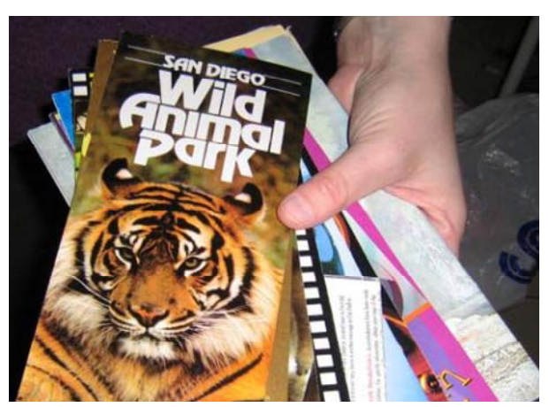
Figure 9: Maps & brochures as trip output

example, a trophy won at the end of a basketball season might be associated with several photo sets, e.g. photos from the season, photos from the winning game, or photos of the team. This confusion could cause difficulties for creating and remembering associations for certain items used with the system. These items also suffer from location problems, similar to individual collectibles, particularly when kept in personal spaces (e.g. bedroom).