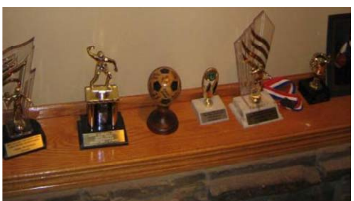
Figure 8: Trophy & medal mementos of personal accomplishment - 20 -

Personal accomplishment may seem like an obvious fit for linking to photos. However, some of these mementos were too general to link to a specific set of photos. For