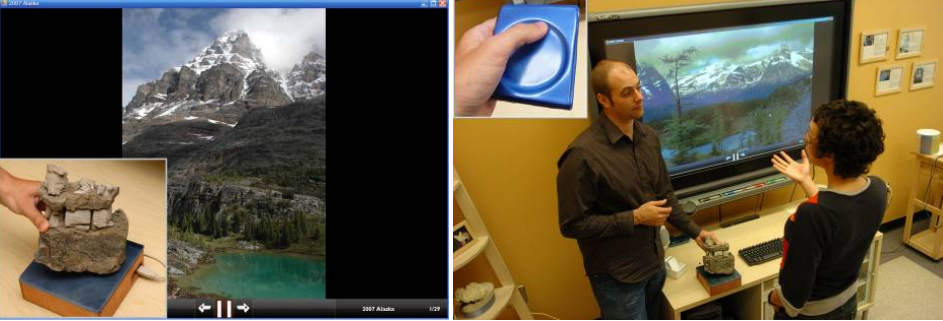
f) Starting the slide show from the rock