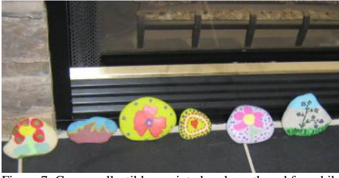
Figure 7: Group collectibles: painted rocks gathered from hikes

Group collectibles tend to consist of many small items, and as such they are often kept together in an out-ofthe-way storage such as a drawer. For example, Figure 6 shows how