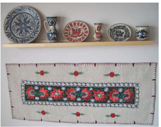
Figure 5: Fragile or difficult to move collectibles

(which evoke cultural memories for another family in our study) are fragile: family members would not want to move or touch them for fear of breaking them. The second problem is location. Items like the dishes in Figure 5 (top) could be in a hard to reach location - the shelf is approximately 6 feet from the floor. The third problem is that sometimes there is no option to move items at all. For example, the cloth art in Figure 5 (bottom) is fixed to its location on the wall. A fourth problem is location. While individual collectibles would most commonly be displayed in areas for entertaining guests, they could also be located in other private or less convenient places around the house. If a desired item were not nearby, it would have to be retrieved for use with a photo sharing system.