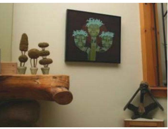
Figure 3: Example collectibles on display in the home

Individual collectibles are typically one-off items chosen to represent a specific place or event. These items can range from knick-knacks (e.g., the birds and ship in Figure 2) to those that are decorative or artistic. Collectibles are often kept on display. Figure 3, for example, shows several collectibles in one family's home. From left to right, the ornamental trees on the shelf, the painting on the wall, and the statue on the stand were all collected from various