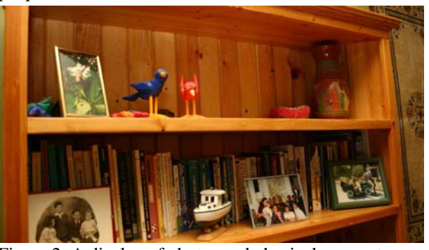
were inspired by an idea, Figure 2: A display of photos and physical mementos

We state outright that our work was originally design oriented: this study came after we had developed a first version of SOUVENIRS. We were inspired by an idea,