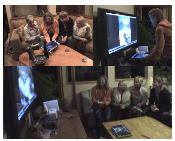
Figure 13.SOUVENIRS, the mobile photo-frame, and pick & drop

associated with the chosen photo set. In this way, the device can be passed over an