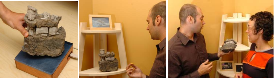
c) linking the rock to photos