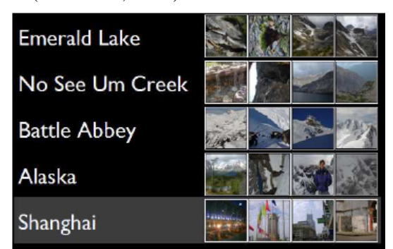
Figure 11:The revised navigation screen

people currently create photo albums around specific events or favored photos vs. organizing all photos, we now expect people to selectively choose photos to share and link, where a large bulk of photos will be left behind. In our changed version, only photos dragged into SOUVENIRS are used by SOUVENIRS. That is, unlike other photo sharing systems, SOUVENIRS does not search all hard drives