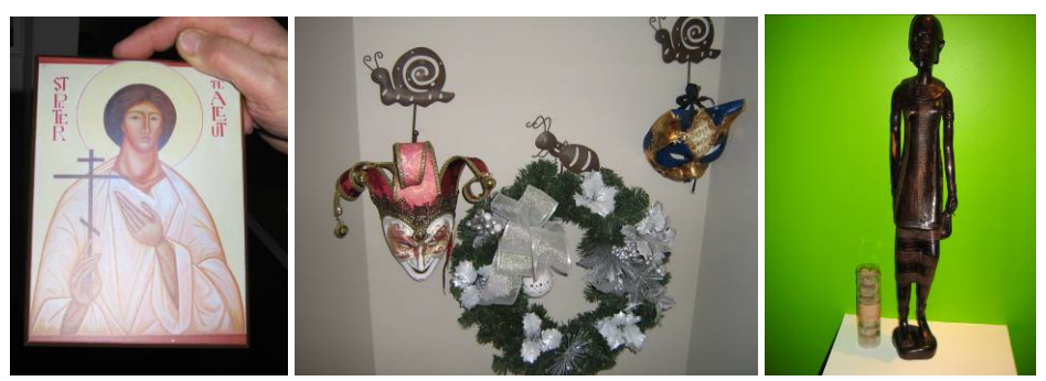
Figure 4: Examples of collectibles reflecting cultural heritage.

This I brought from Romania, we like this kind of art. When we see them we think about the places in the mountains. They have villagers...people from the village that don't have studies to do art. They do crafting...that kind of art. And I think about those places, as we used to go to the mountains. They were displaying them on the streets there.