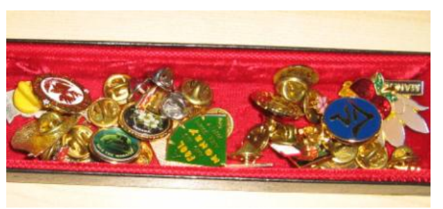
Figure 6: Group collectibles: pins kept in a drawer

Group collectibles are another sub-category of collectables, where the owner has a special interest in a certain type of object and seeks to form a collection of them. Some of the items we saw were from trips the collector had been on personally, while others were gifts from friends who knew that the person had an interest in that type of item. Examples include money, stamps, postcards and even souvenir pins from various countries (Figure 6).