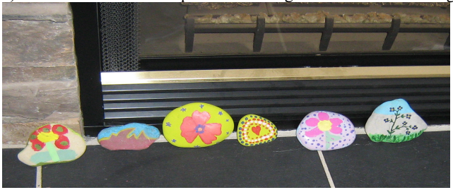
b) Group collectibles: rocks gathered from hiking trips & painted