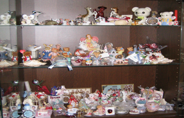
d) A collectibles showcase