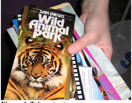
Figure 4. Trip output.

certificates for activities such as sports or musical performance. They are usually placed for display on a shelf or wall, and often related items are kept together. For example, Figure 3 shows a shelf in a child's room that contains all her trophies and awards.