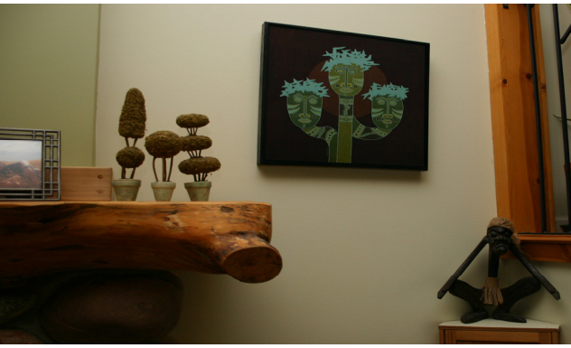
a) Individual collectibles: public artwork gathered while travelling

"When you walk into someone's house and you see something that you