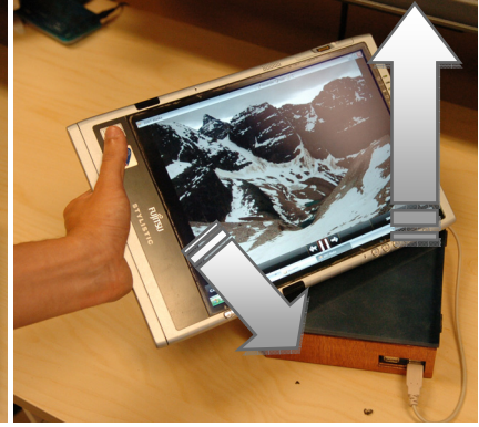
Figure 5. Photos picked and viewed on tablet & dropped onto the large display

home network, where photo sets are stored on a central server. Consequently, people can now access Souvenir photos from any computer on that network. As a Souvenirs client connects to the server, all new photos since the last connection are cached on the local computer to make navigation and display responsive.