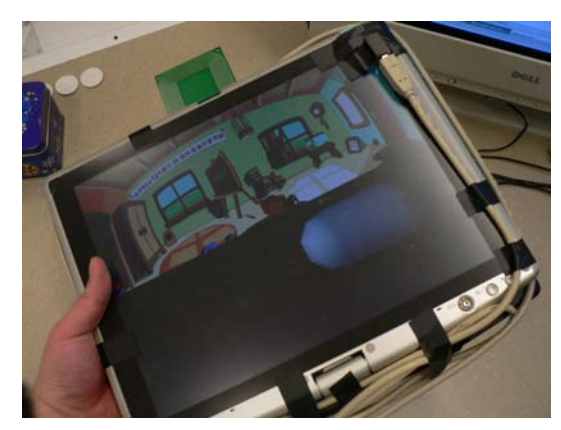
Figure 2. Tablet PC sketch pad with accelerometer and RFID reader

The general concept of Purple Crayon is to provide a rich interactive environment where children can nurture their creativity by intuitively creating virtual entities they wish to play with and freely interacting with them in a physical manner. This interactive environment is also expected to encourage social