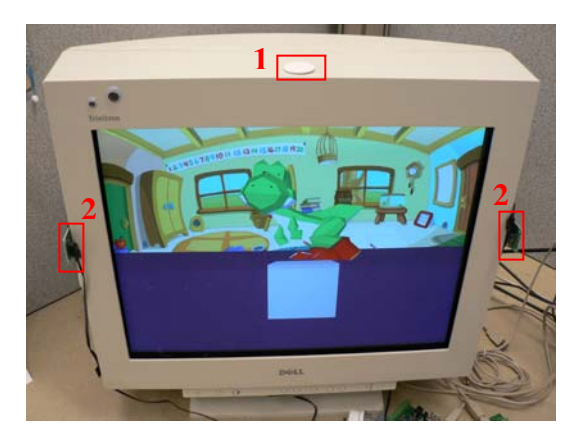
Figure 3. Play stage setup with RFID tags (1) and touch sensors (2)

PCs with monitors, large wall displays, and notebook computers are used. Each display must also have RFID tags attached to enable the transfer of virtual entities. Various Phidget sensors are also placed on or near displays to enable physical interaction including touch sensors, light sensors, motion sensors, and RFID readers. Some displays were setup with mixed reality capabilities, using a web cam and a set of mixed reality markers as additional interaction handles.