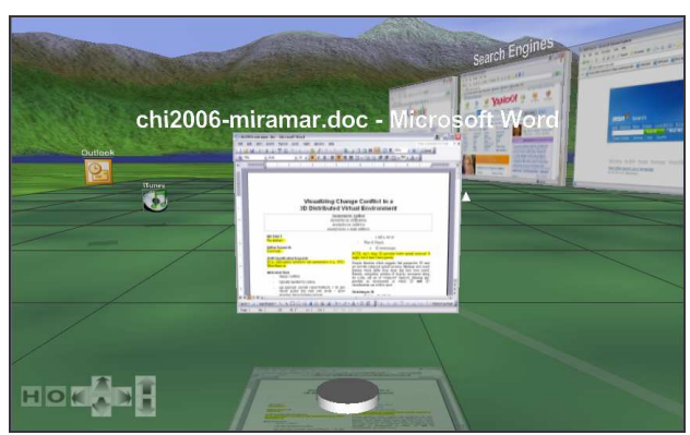
Figure 1. A close-up view of a document in Miramar. The navigation bar at the bottom-left of the scene includes buttons for (from left) home, overview, and movement arrows. Shadows appear as a reflection of the object.

visual feedback. To further simplify the experiment, we also limit the information provided through the stretchies, and do not include other feedback, such as who, when and why the changes were made [17]. We compare the use of this feedback to an optimistic synchronization policy.