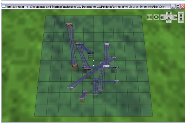
Figure 4. A typical Miramar scene in the asynchronous case when the stretching visualization was used initially (left), after zooming out (middle), and upon using the overview feature (right).