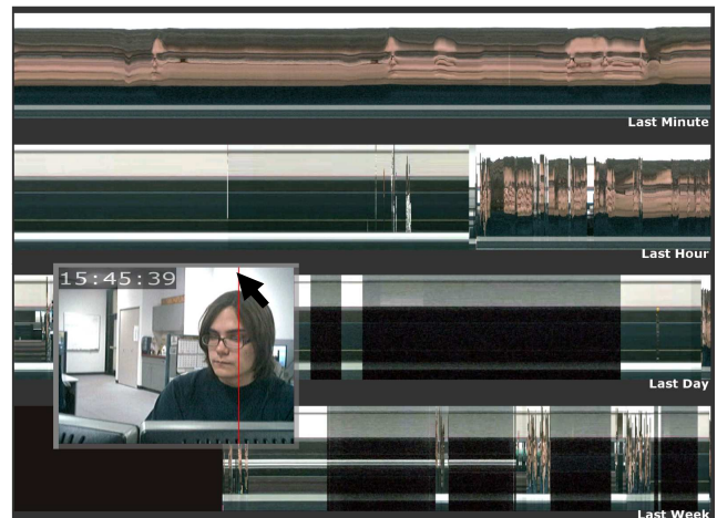
Figure 1. An example of the Timeline showing the video history of a personal workspace over several days.

Gutwin [3] suggested the idea of traces – visualizations of the