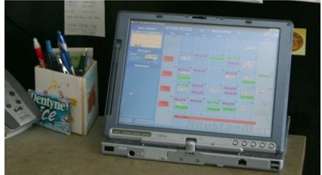
Figure 1. LINC in a family's kitchen.

Copyright is held by the author/owner(s) CSCW '06, November 4-8, 2006, Banff, Alberta, Canada