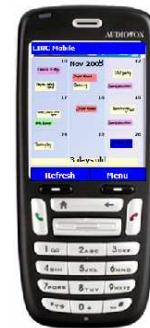
Figure 3. LINC Web and LINC Mobile.