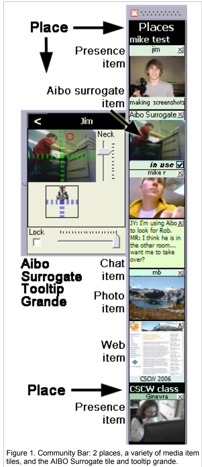
Figure 1. Community Bar: 2 places, a variety of media item tiles, and the AIBO Surrogate tile and tooltip grande.

Using Figure 1 as an example, the group sees through the tile view that the robot is currently in use, i.e., that it is being controlled by another group member. The chat also mirrors this interaction, where one person tells the other “I’m using the AIBO