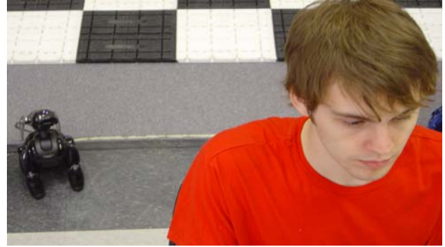
Figure 3. How AIBO Surrogate appears in the real world

The walk control , shown at the bottom of the tooltip grande as blue crosshairs and a robot dog icon, lets the person control the robot's movement. Clicking left or right of center controls how quickly the robot turns left or right. Clicking above or below the center controls how quickly the robot walks forward or backward. Clicking the center tells the robot to stop moving. Thus the controller can make the AIBO walk and turn in any direction by clicking and holding on a desired position. Control feedback of the current walk parameters is provided by the robot icon snapping to the mouse position and following the mouse as it moves. The robot maintains the target speeds until the person