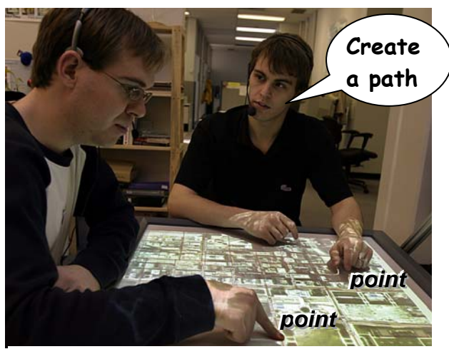
Figure 2. Google Earth on a table.