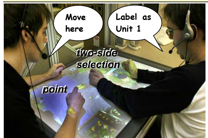
Figure 3. Two people interacting with Warcraft III.