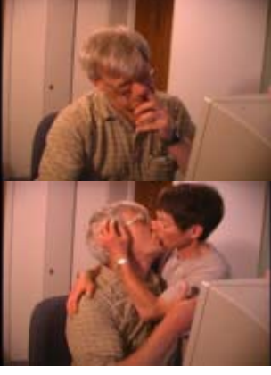
Figure 1: Male versions of the five video scenes: Working, Picking Nose (top row), No Shirt, Kissing (middle row), Changing, (bottom row).