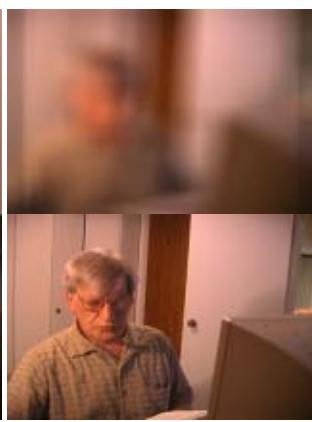
Figure 2: A sample of blur levels: levels 1 and 3 (top row respectively), levels 7 and 10 (bottom row, respectively). Level 10 is the unfiltered scene.