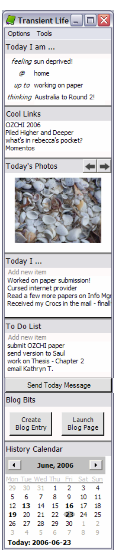
Figure 2. Transient Life System

Following the above requirements, we designed Transient Life (Figure 2). It is a tool that allows people to easily collect information as it occurs. It also distributes the collected information in various ways corresponding to the different outlets of personal information, i.e., it is selectively displayed in the IM display name field,