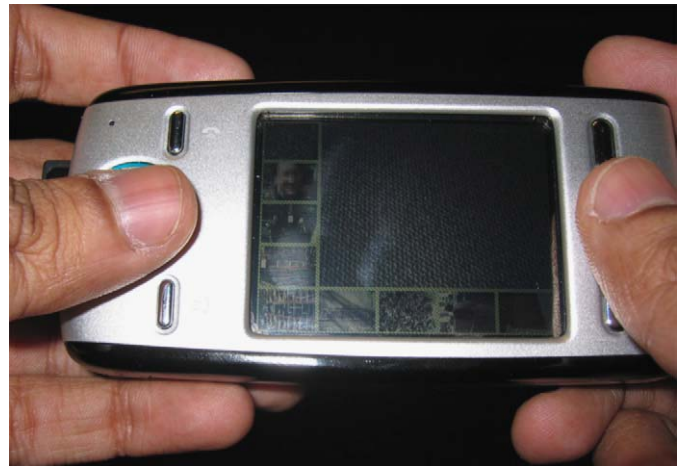
Fig. 3. The Motorola E680i running Mobiphos.

Our first version of the application kept all images at full resolution loaded in memory. This implementation worked well when testing the application on a desktop computer. However, the program become sluggish or unresponsive