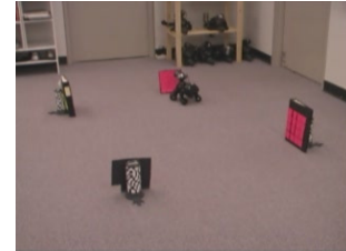
Figure 2. Patrolling around the markers and inspecting the door.

The AIBO patrols an area designated by four pink markers in a rectangular fashion. It can inspect objects (a door in this case) that are behind the set of markers (see Figure 2).