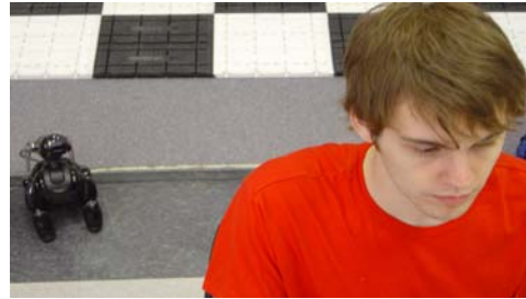
Figure 3. The AIBO Surrogate in the real world

The AIBO ERS 7 is a programmable robot dog produced by Sony. The AIBO Surrogate item communicates with and controls the robot using the Tekkotsu framework software [8]. The AIBO Surrogate was developed using CB plug-in capabilities [5], and has both an owner and an audience : the owner posts the item, all other users are the audience. This separation allows for the owner to be the one to communicate with the robot while the audience