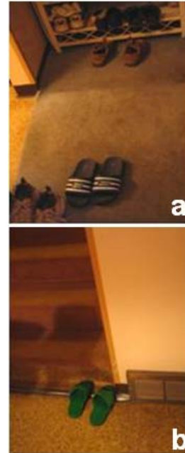
Fig. 6: Slippers indicate presence and location.

Figure 6 shows how one of the participant households evolved a particularly rich system for handling awareness information. Each member of the household would wear different colored slippers while in the main floor of the house, as it was tiled and cold on bare feet. These slippers would be left in the main entryway (Fig. 6a) when the wearer was not in, or at the foot of the stairs when they were upstairs in the carpeted area of the home (Fig. 6b). In this way, family members always knew who was home, and their general location in the house. The presence of an object in a routine location can provide information to household members.