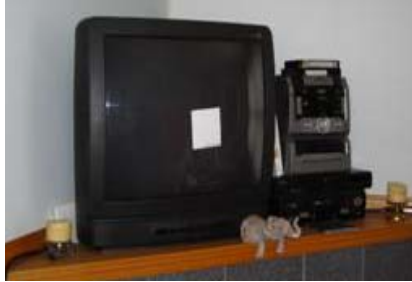
Fig. 2: Urgent message from mother to son