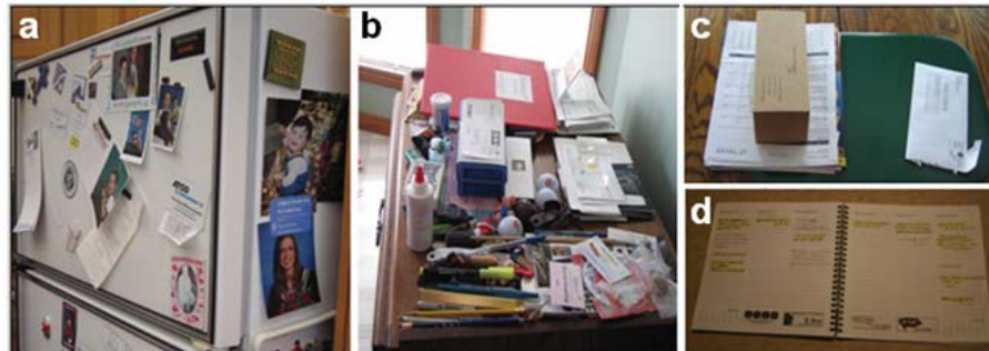
Fig. 5: Spatial Ownership

public subset spaces, personal spaces, and private spaces. Public spaces are those owned by everyone in the home. For example, the main house phone or the fridge door are usually considered public spaces, and messages affixed or near it may be for anyone. Figure 5a shows a fridge door used as a public space, where everyone can see it, place items on it, and interact with those items.