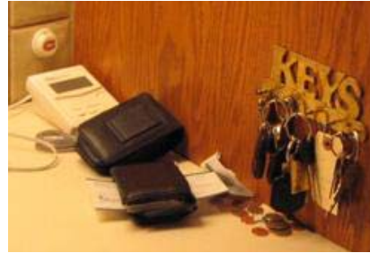
Fig. 3: Envelopes to be mailed placed with keys