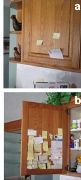
Fig. 4: Information dynamics

However, if the member needs to keep the message, e.g., contact information that one does not wish to lose, it may be placed on the inside of the cupboard door for a kind of longer term common archive (Fig. 4b). The household knows that messages on the inside of the door are there for storage, while those on the outside still need to be dealt with. In this way, locations provide a sense of the dynamics of the information.