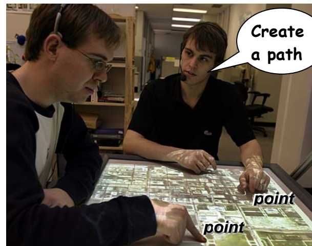
Figure 2. Google Earth on a table.