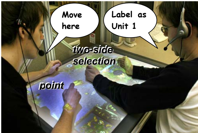
Figure 3. Two people interacting with Warcraft III.